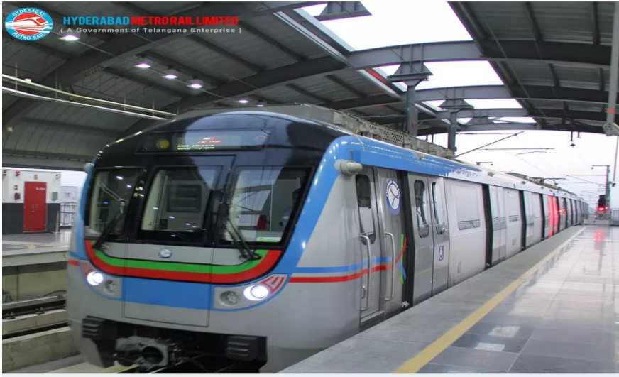
Enhancing Hyderabad's Image