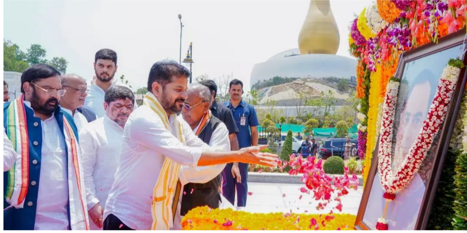
Gandhi. Also Read - Part Time Job Fraud Tops Cyberabad Crime in 2025 According to the Chief Minister, the People's government is moving for-

Hyderabad: Chief Minister A Revanth Reddy here on Thursday demanded that the Prime Minister Narendra Modi immediately convene a special session of Parliament and introduce Women's Reservation Bill in the Lok Sabha. "India Alliance will extend full support for the 33 percent Women's Reservation Bill. If you want to do politics under the guise of women's reservation, then it will not be accepted," he said. He was speaking after paying tributes in connection with the death anniversary of Rajiv