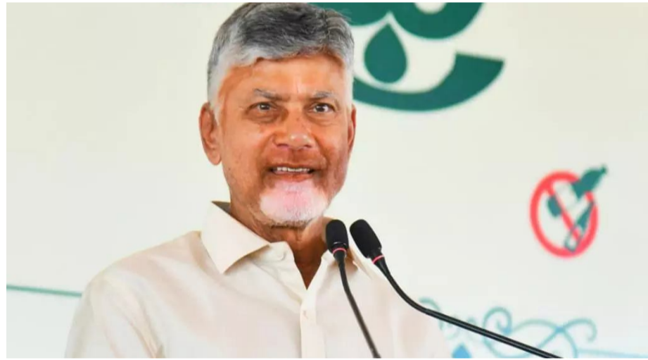
measures to support the families of fishermen who lose their lives in accidents while fishing. He noted that Rs 3.15 crore was released towards 63 insurance claims during 2024-25, while Rs 5.65 crore was disbursed towards 113 pending claims during 2025-26. Naidu also observed that the government is promoting seaweed cultivation to improve livelihood opportunities and enhance income generation for the families across the state.